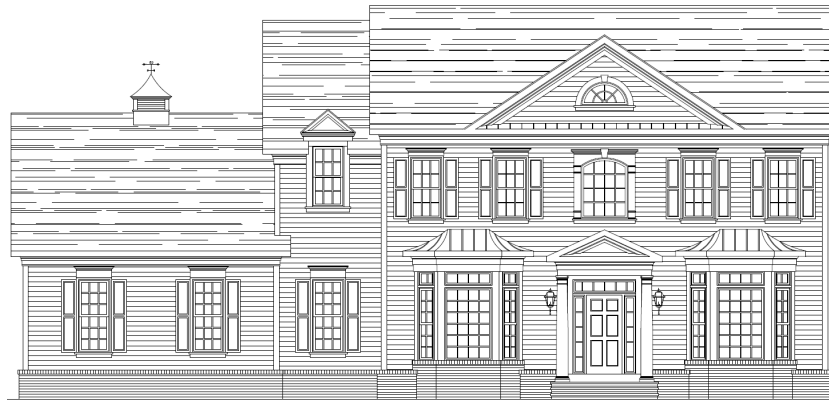
SAGEWOOD LANE ELEVATION 2A