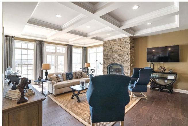
Family room with optional coffered ceiling, recessed lighting, and stone fireplace.