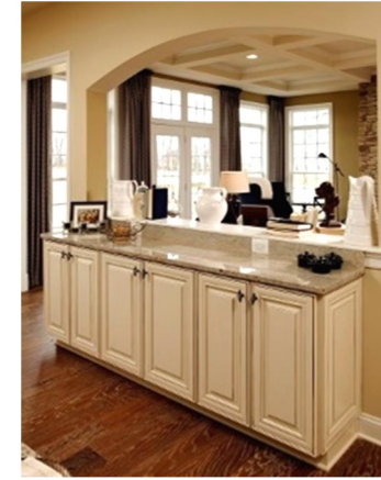
18" buffet on kitchen/family room shared wall