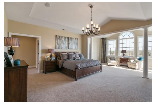
Alternate owner's suite with vaulted ceiling and sitting room