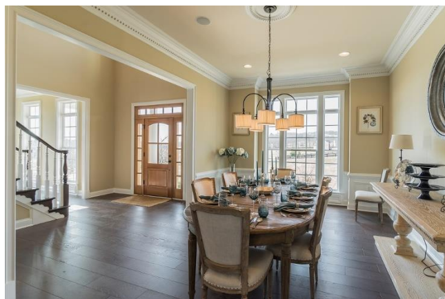
Spacious dining room opens to two story foyer