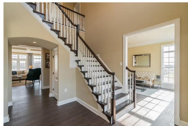
Two story foyer with optional oak staircase