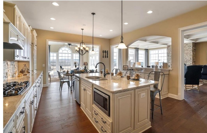
View from kitchen island into the keeping room and family room