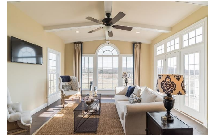
Keeping room with beamed cathedral ceiling, arched window wall, French doors, recessed lighting and ceiling fan