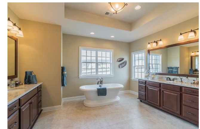
Owner's bath with optional freestanding tub, framed mirrors, upgraded cabinets with hardware, and granite countertops