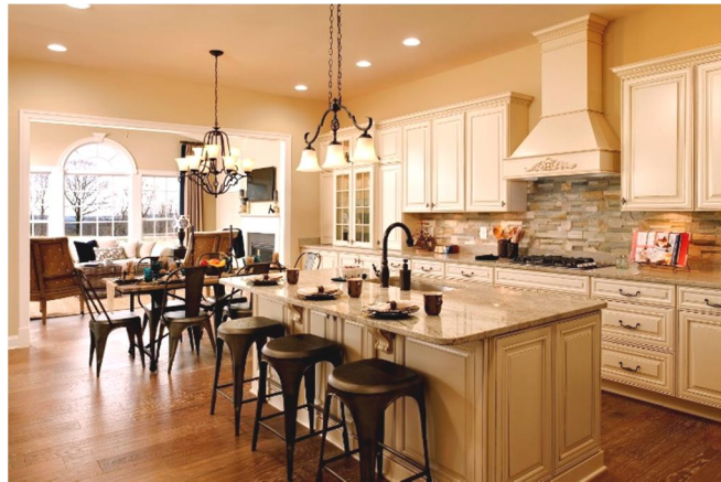
Kitchen shown with upgraded hood design, cabinets, lighting, sink and faucet, backsplash, hardware, and optional keeping room