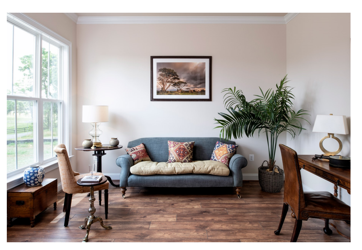
Library with crown moulding

Photos of decorated model homes show structural and product options that are not included in the base price of a home. Photos are for illustrative and informational purposes only and are not part of or included in any contract. Blueprints take precedence over marketing materials. Plans, elevations, standard features, and options are subject to change without notice. See Sales Manager for details. 2/4/2022