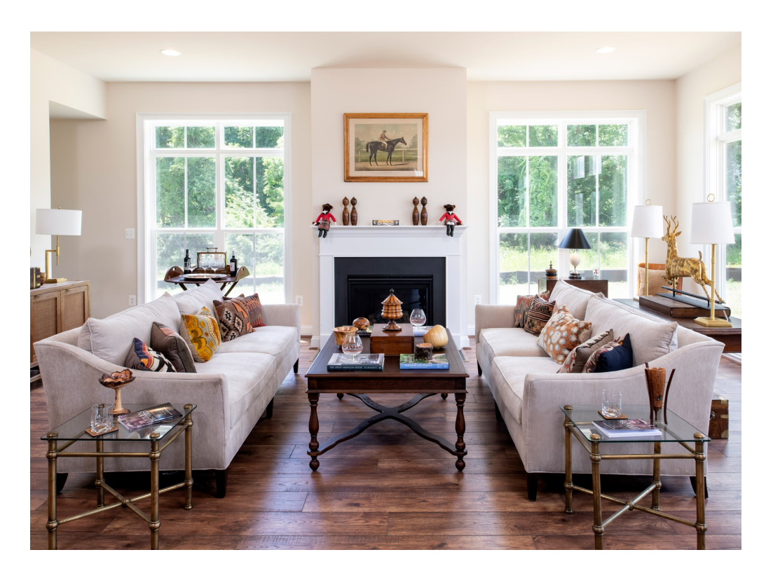
Extended family room with gas fireplace and optional windows