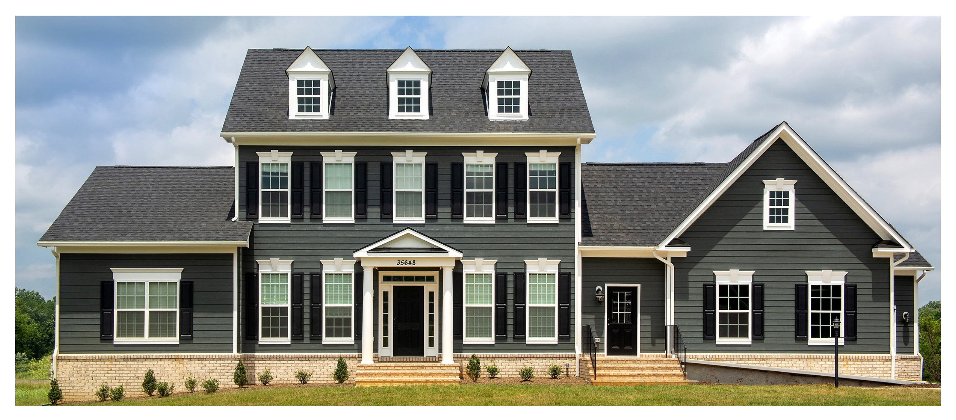
Elevation 1A shown with optional dormers, mudroom entrance, and three-car garage