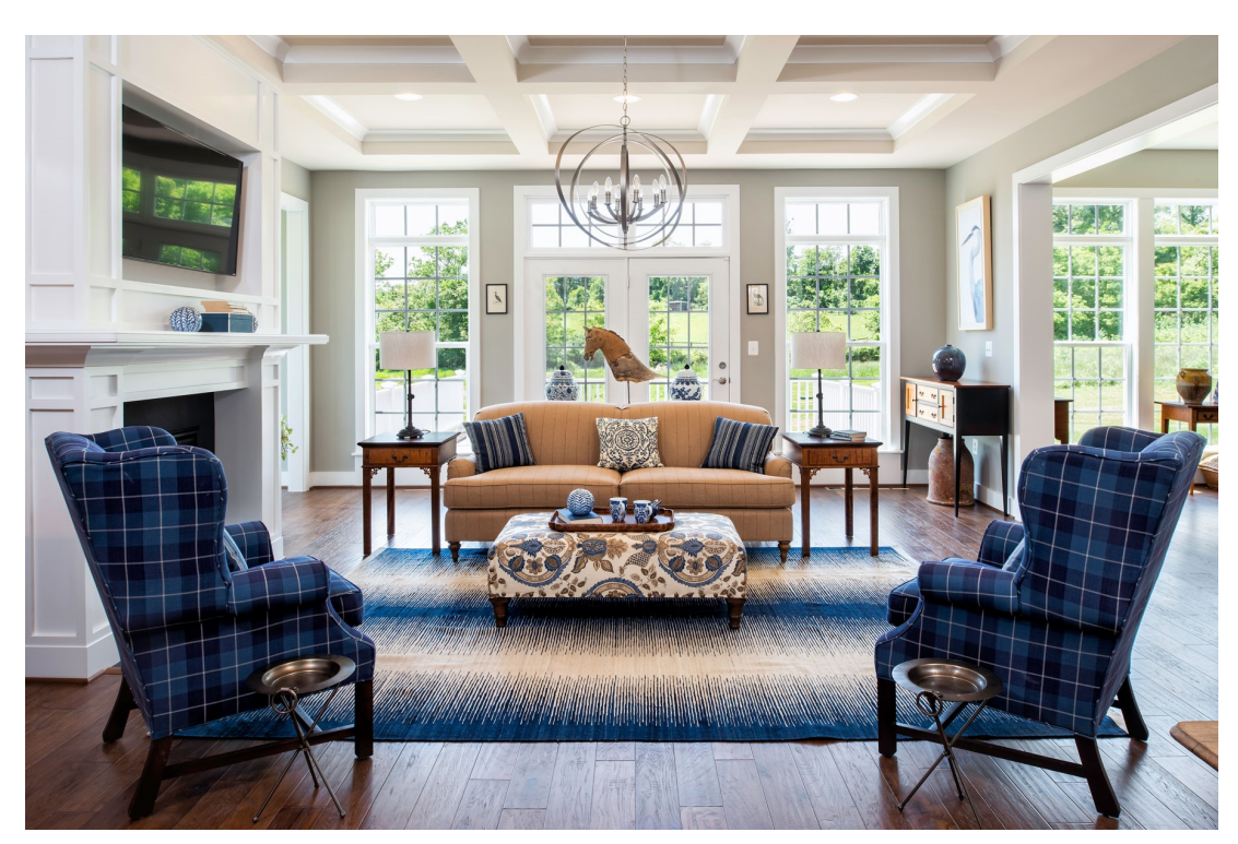
Family room with optional coffered ceiling, craftsman fireplace, and French doors