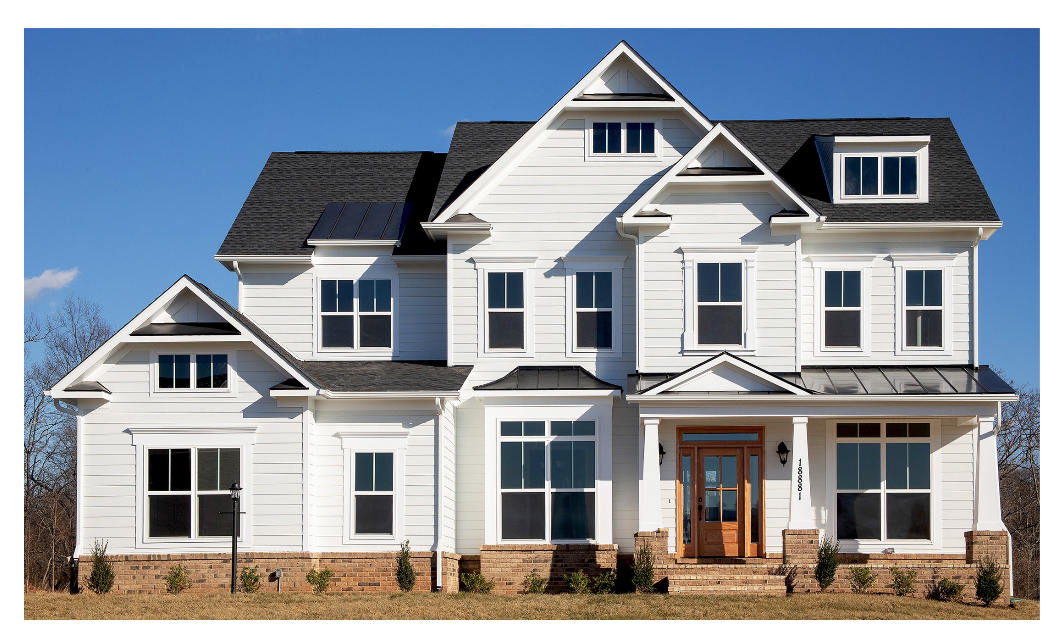
Elevation 5B shown with optional mahogany door