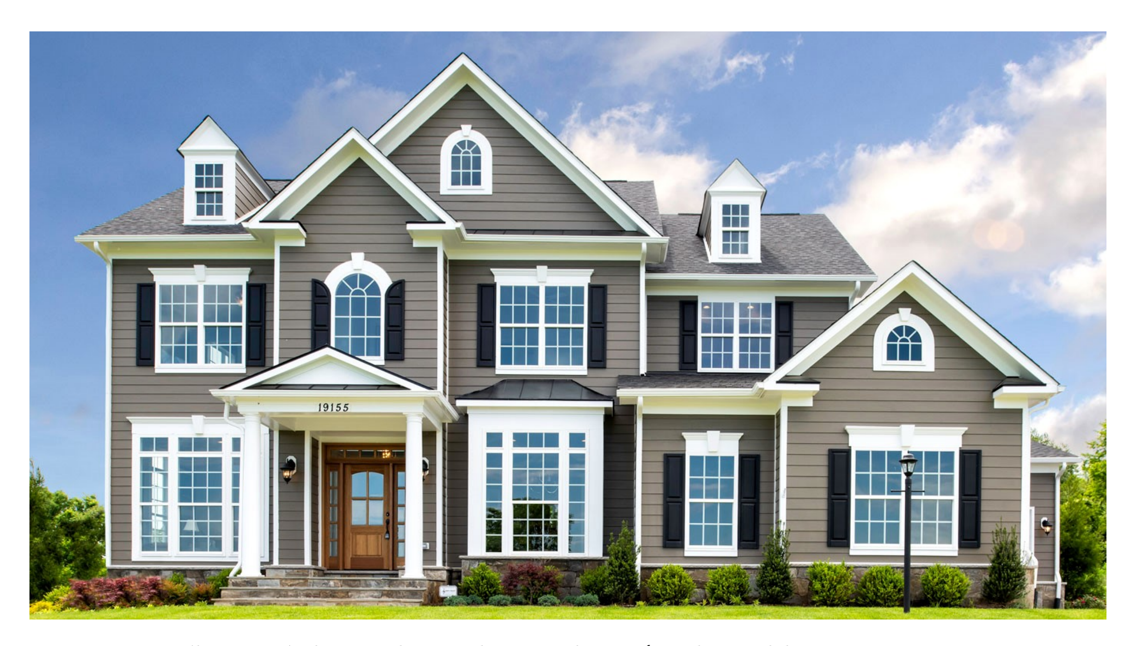
Elevation 4A shown with optional stone, mahogany front door, and three-car garage