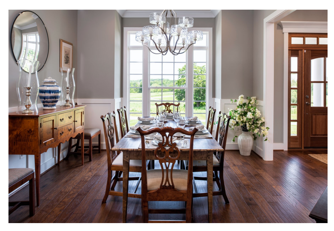
Dining room with craftsman trim, upgraded lighting, and full box bay window