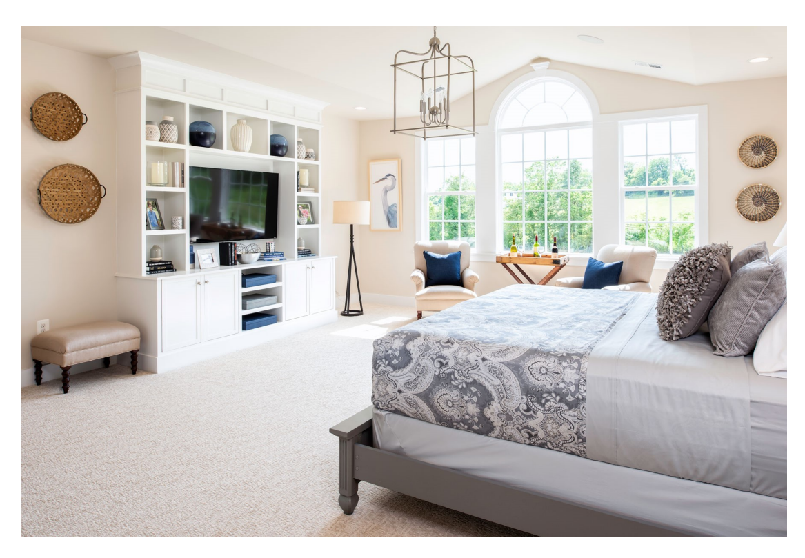
Owner's suite with vaulted ceiling, beautiful arch-topped windows, and custom built-ins