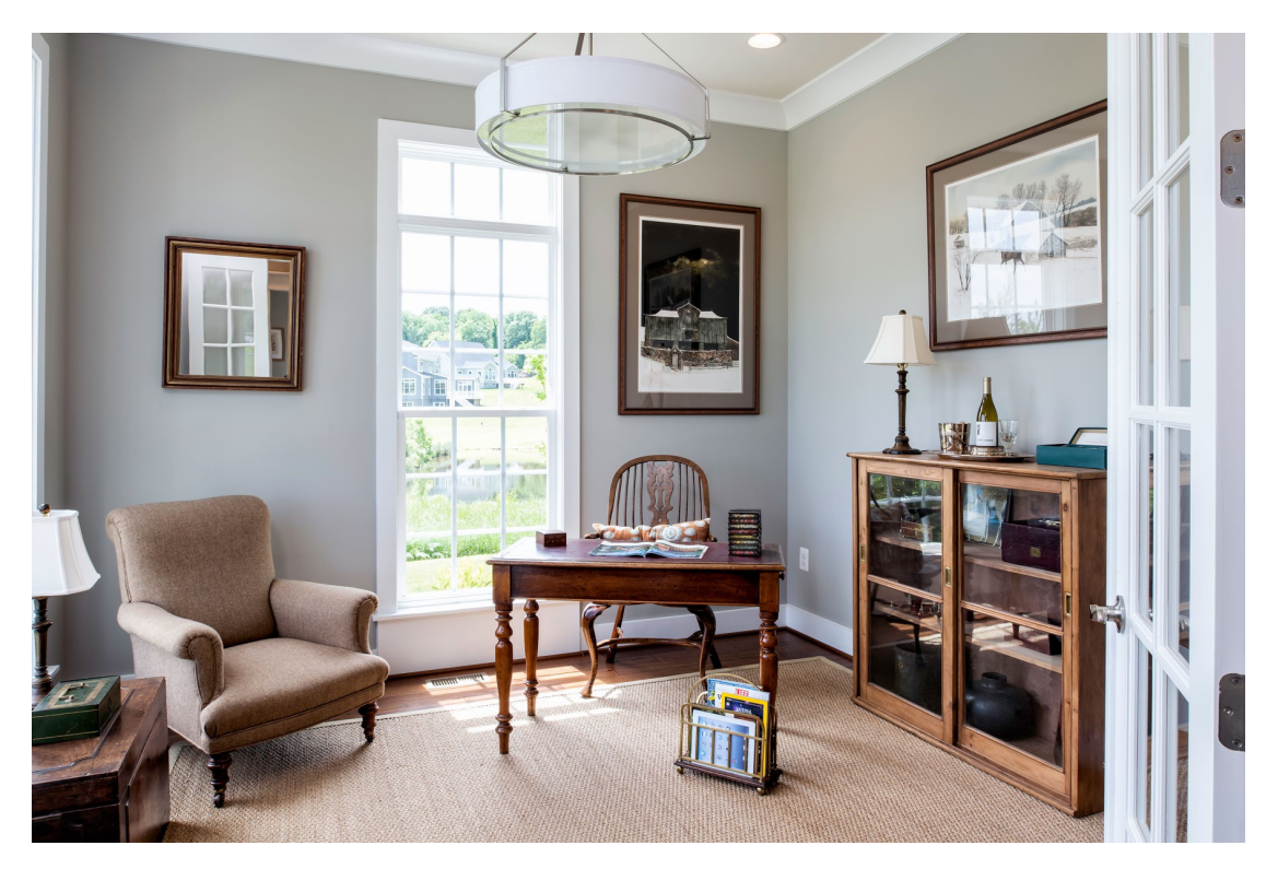
Library shown with double French doors and optional side window