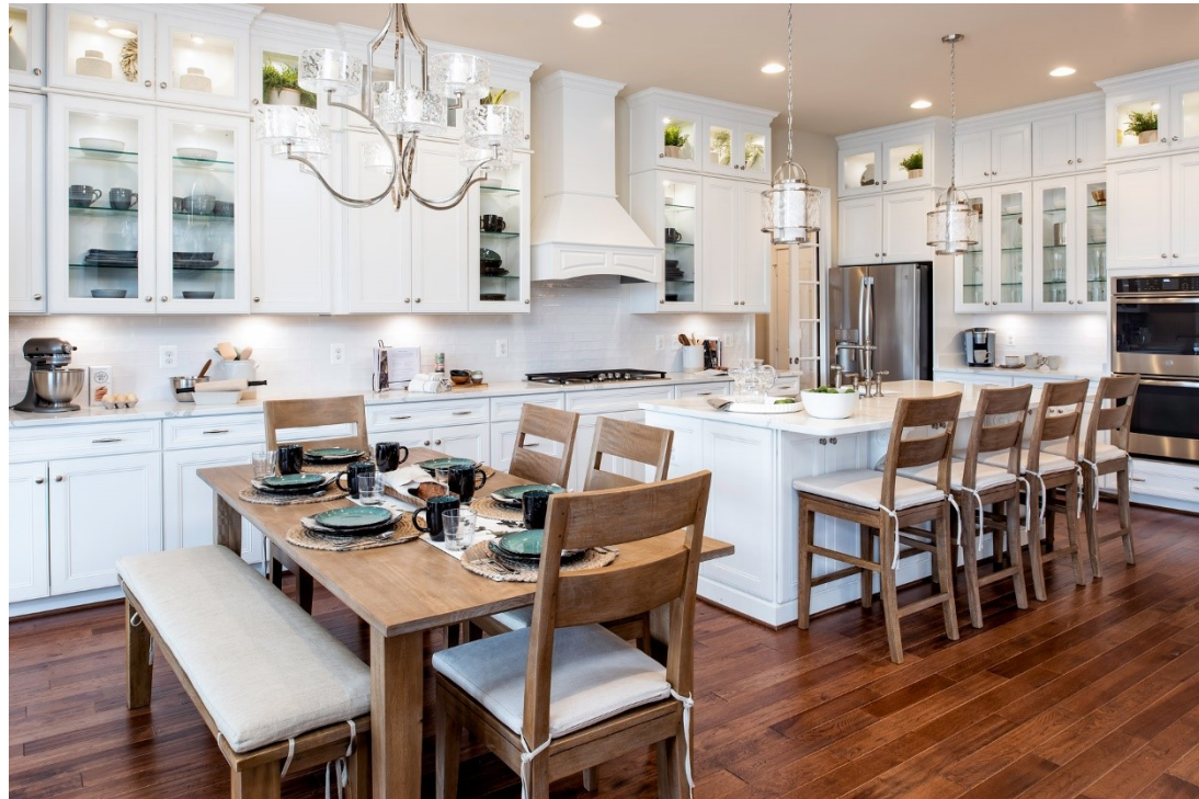
Kitchen shown with upgraded stacked cabinets with glass accents, extended breakfast nook with modified hutch, hood, backsplash, and upgraded lighting