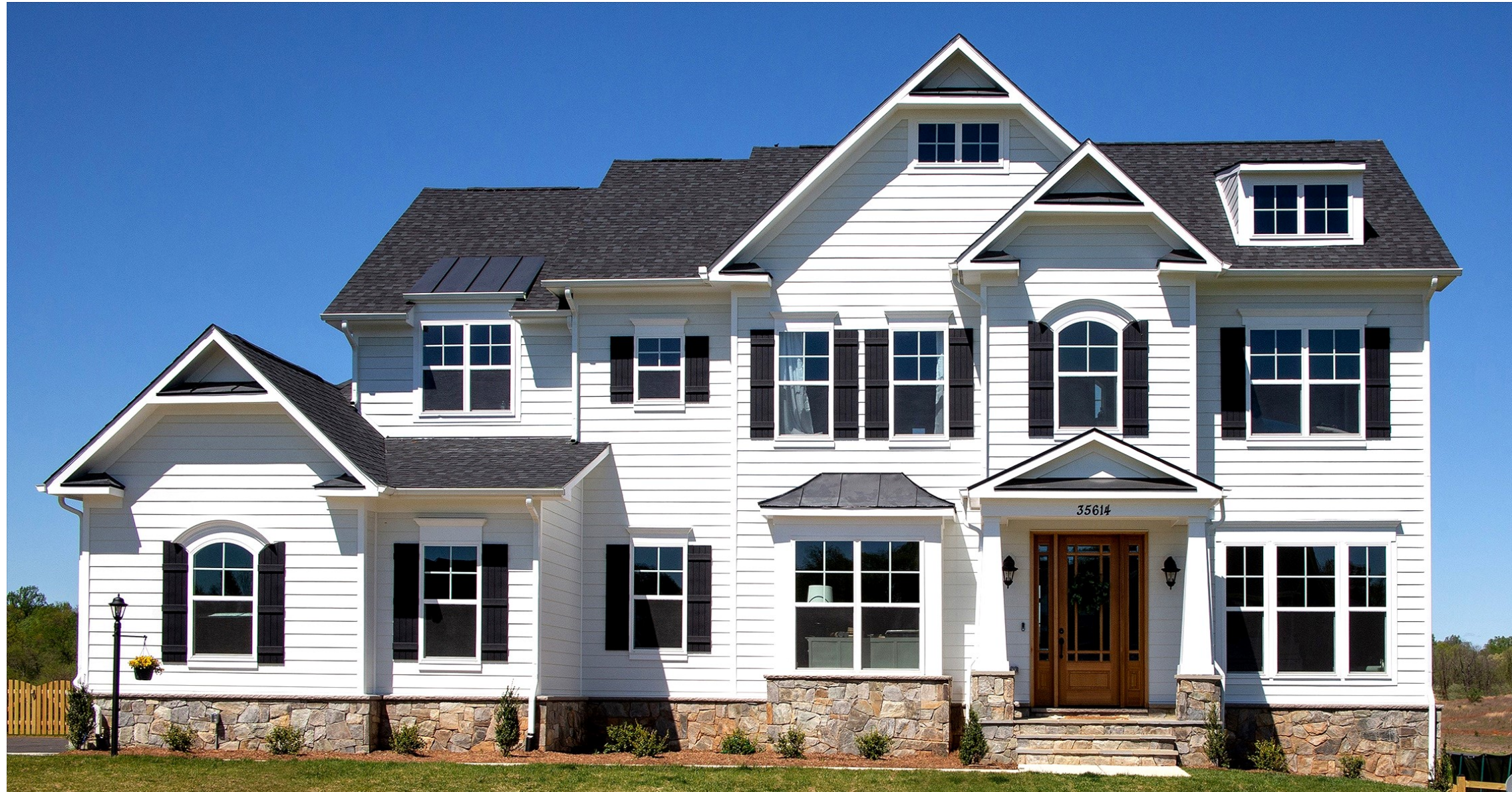
Elevation 6A shown with optional stone water table and mahogany front door

Take a virtual tour of the Glen Springs at CarringtonBuilder.com