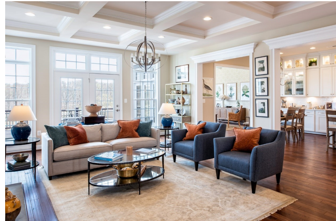
Family room with coffered ceiling looking into the kitchen and keeping room