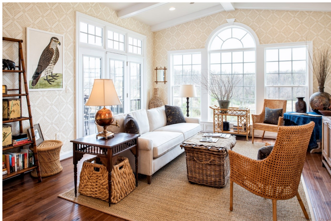
Optional keeping room with vaulted beamed ceiling, window wall, and French doors