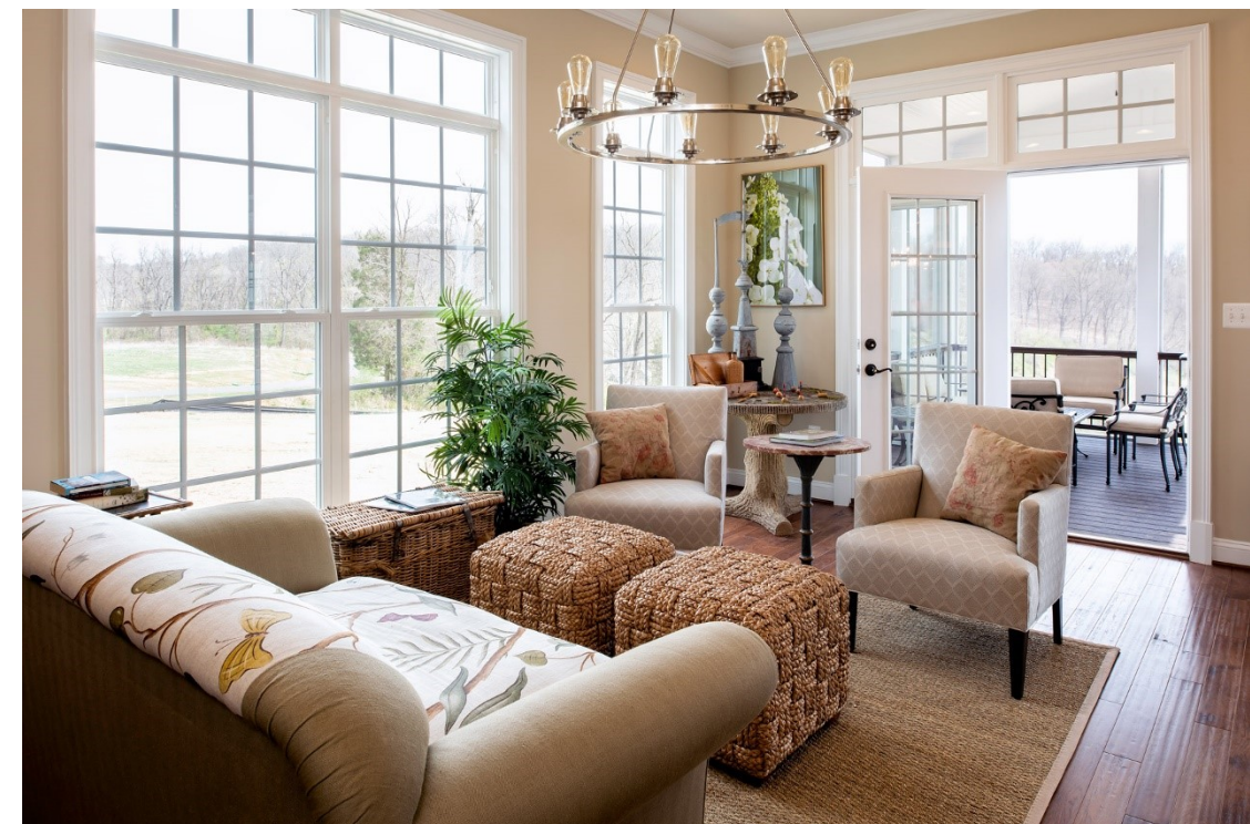
Optional rear club room with French doors leading to screened porch