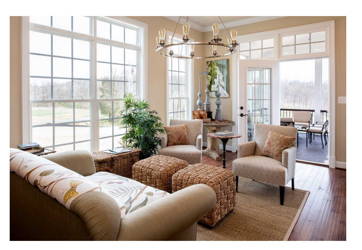
Optional rear club room with French doors leading to screened porch

Photos of decorated model homes show structural and product options that are not included in the base price of a home. Photos are for illustrative and informational purposes only and are not part of or included in any contract. Blueprints take precedence over marketing materials. Plans, elevations, standard features, and options are subject to change without notice. See Sales Manager for details. 2/4/2022