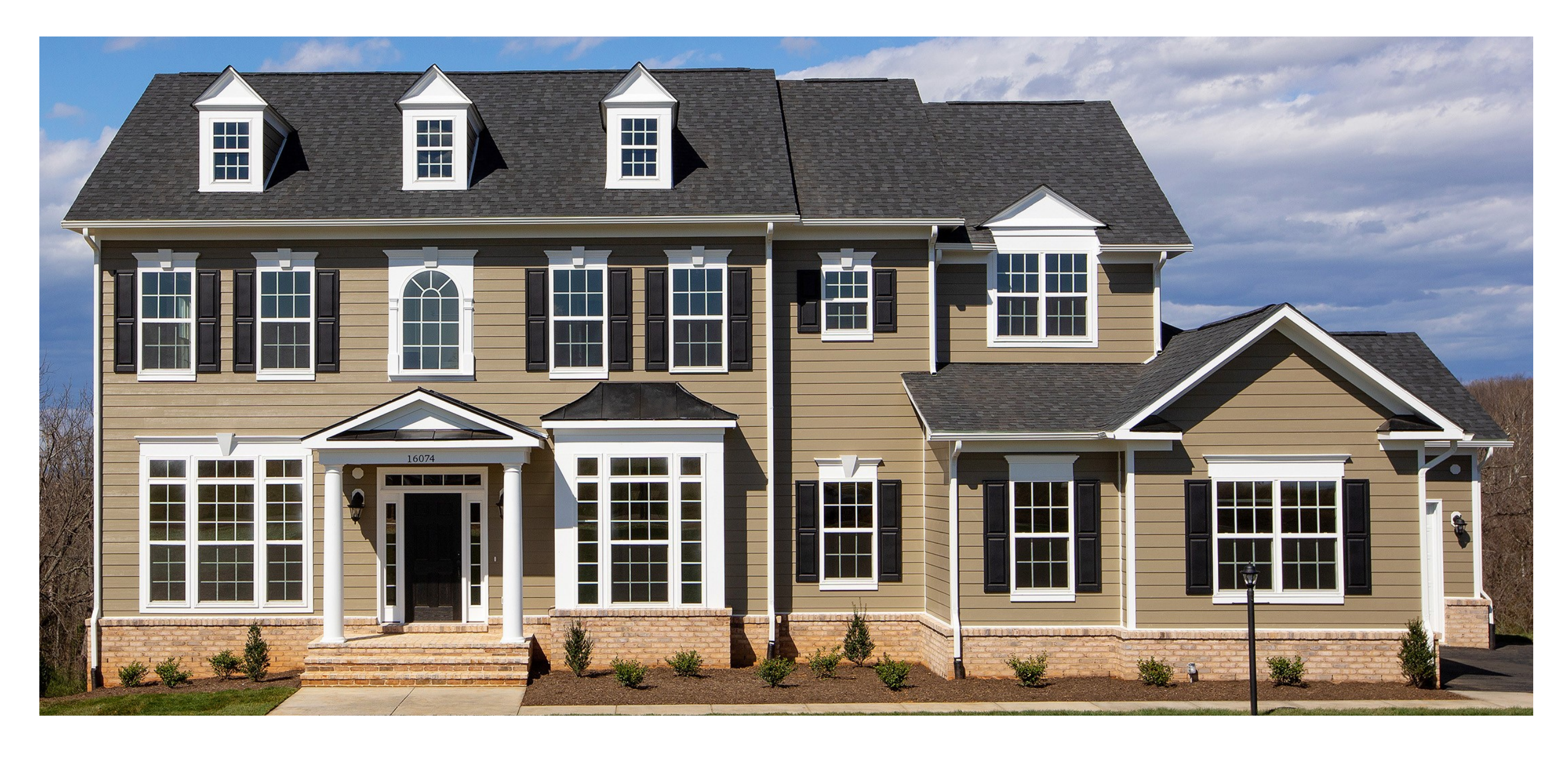
Elevation 1A shown with optional dormer windows