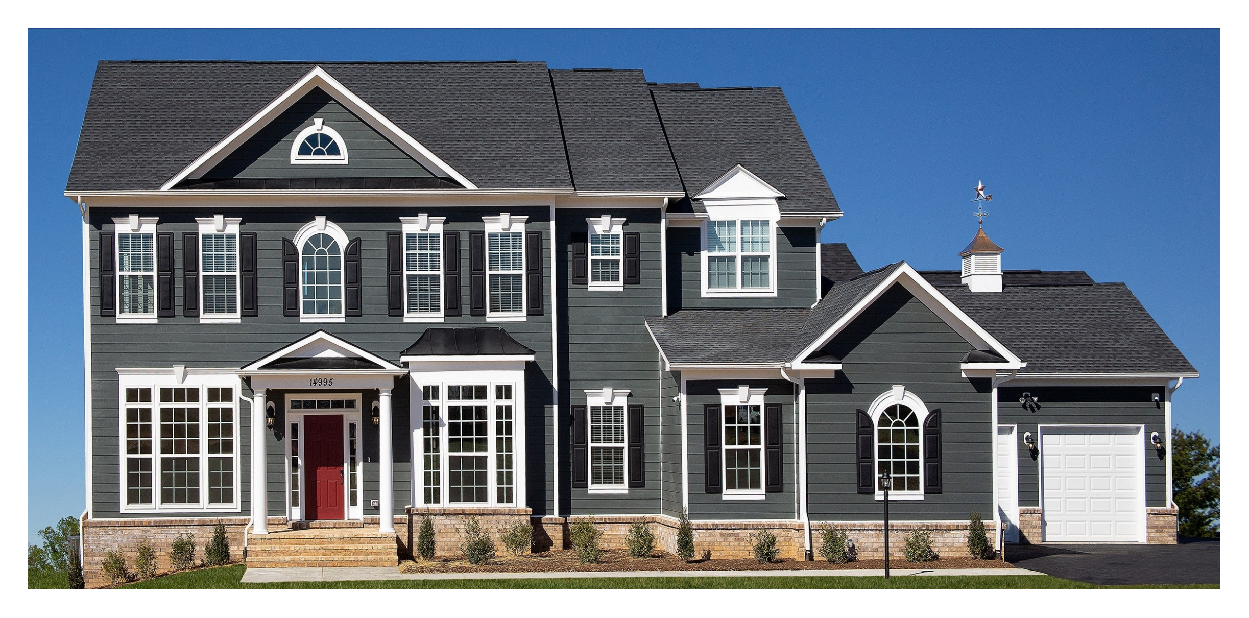
Elevation 2A shown with optional four-car garage and cupola with weathervane