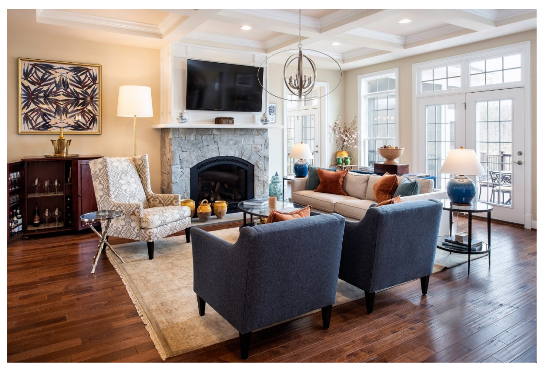
Family room shown with optional coffered ceiling, stone fireplace, and French doors