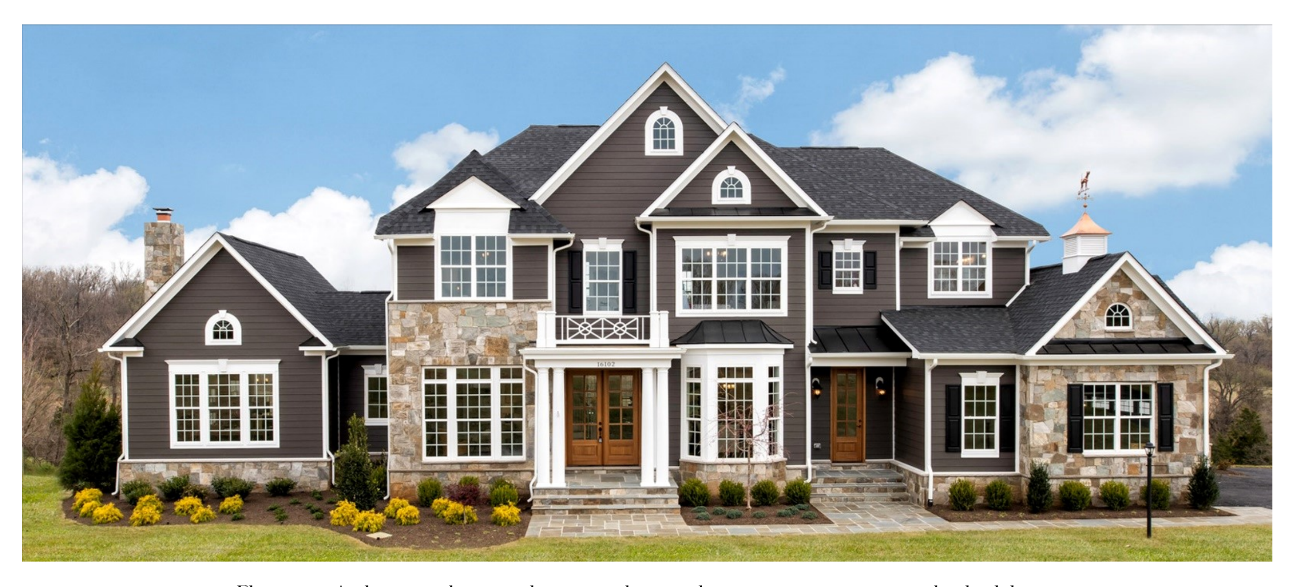
Elevation 7A shown with optional stone, mahogany doors, service entrance, and side club room