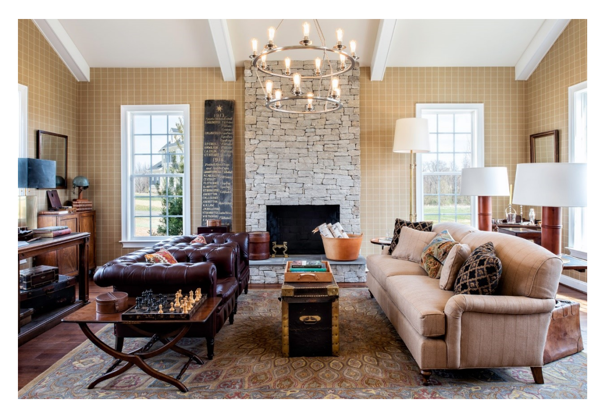
Optional side club room shown with stone masonry fireplace