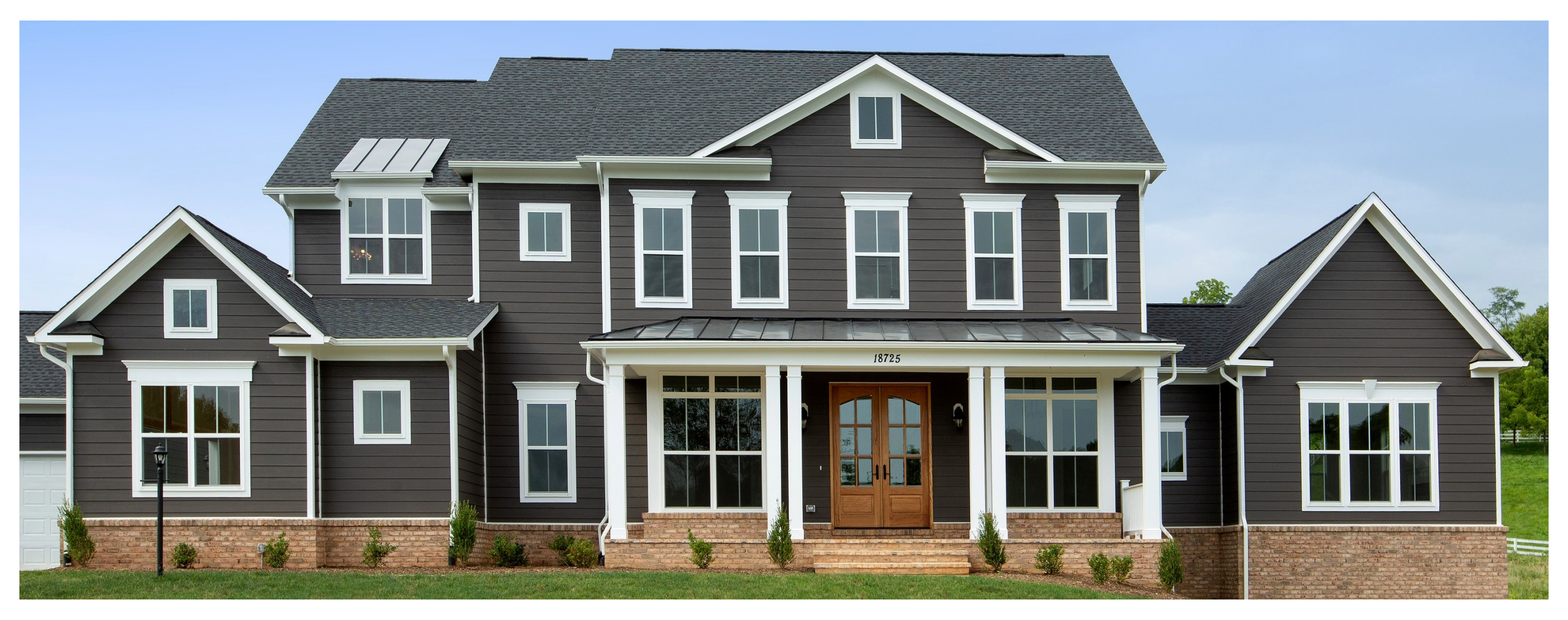
Elevation 9B shown with optional double mahogany doors and side club room