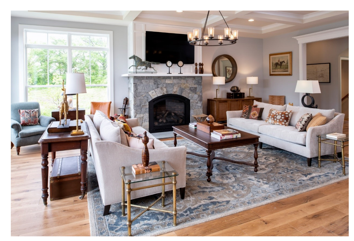
Expanded family room with optional coffered ceiling and stone fireplace