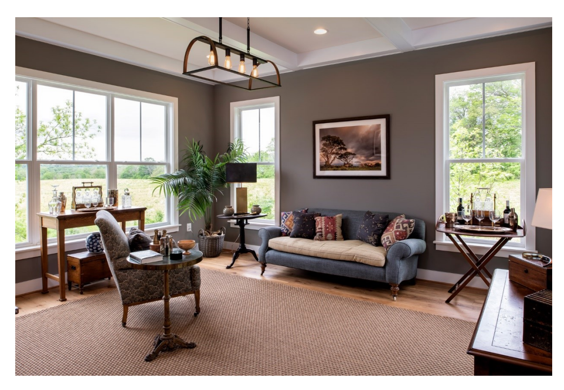
Flex room can be optioned into a club room with beamed ceiling