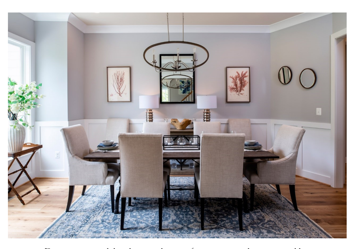
Dining room with box bay window, craftsman trim, and crown moulding