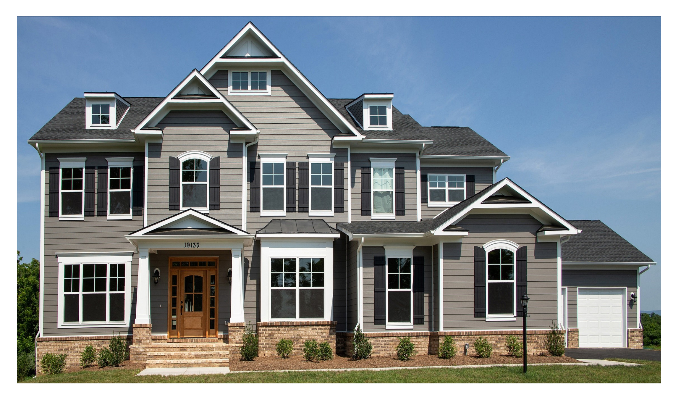
Elevation 10A shown with optional mahogany front door and four-car garage