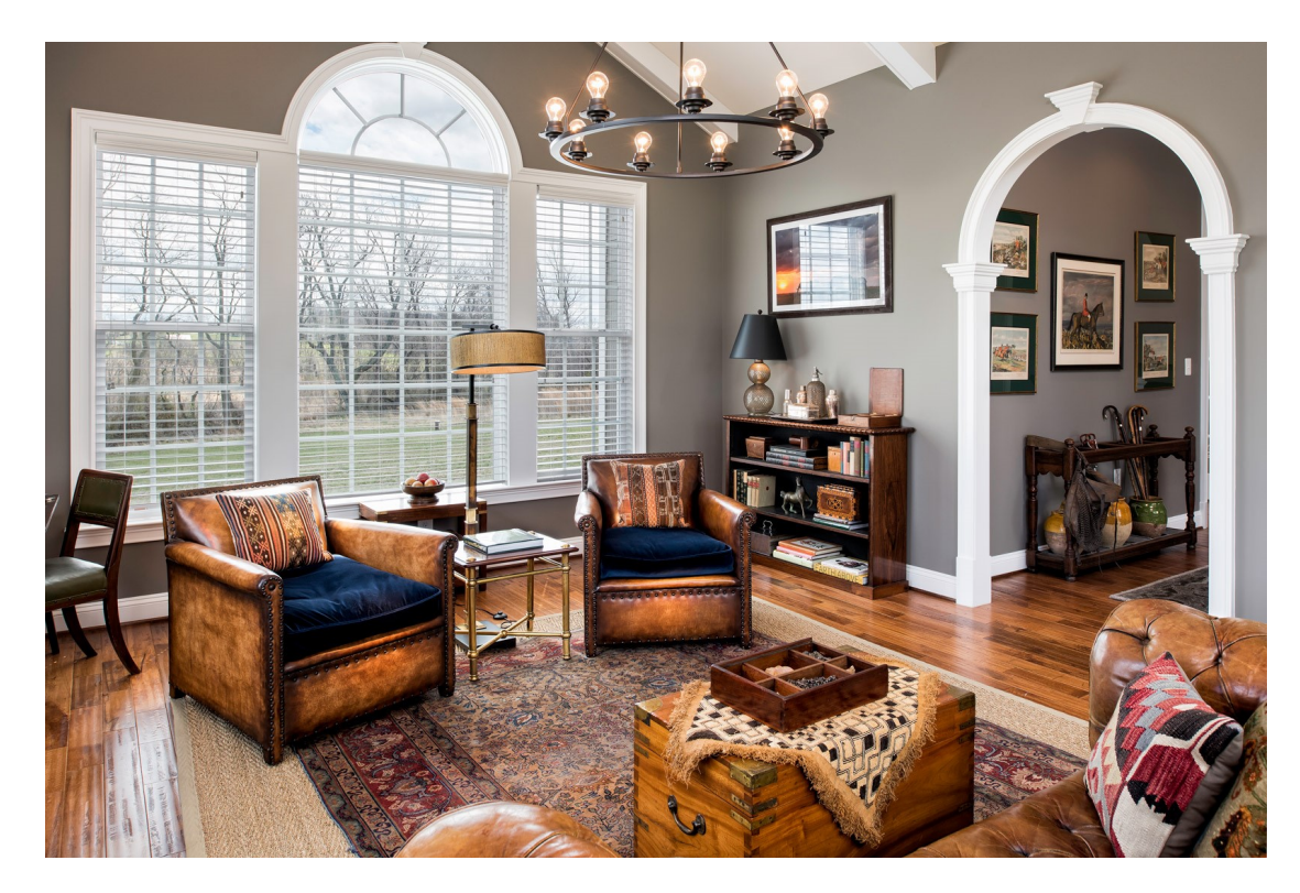
Optional side club room with vaulted beamed ceiling and trimmed arch to art gallery