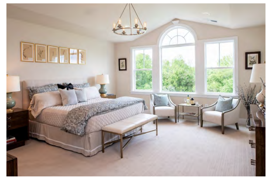
Owner's suite with vaulted ceiling and arched window wall