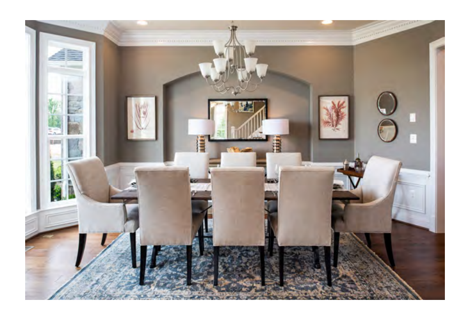
Dining room with bay window and art/furniture niche