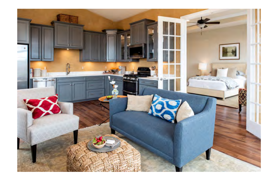
Optional multi-generational suite with kitchen, living space, bedroom, and full bath