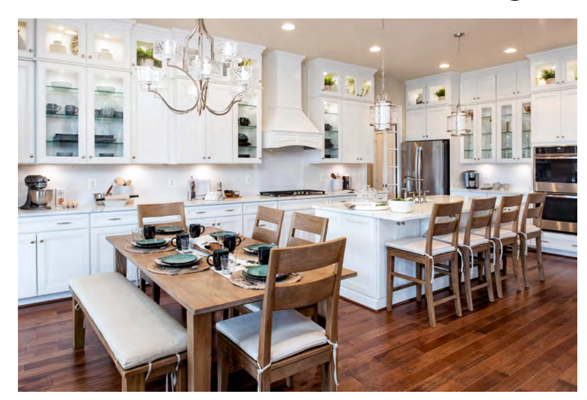
Kitchen shown with upgraded hood design, stacked and glass cabinets, upgraded lighting, and backsplash