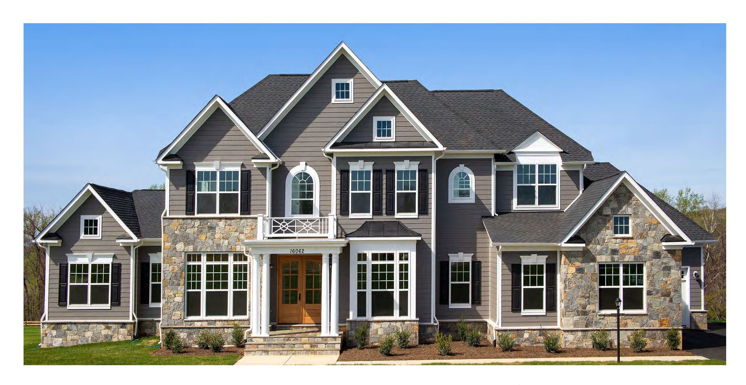
Elevation 5A shown with optional stone and double mahogany front doors