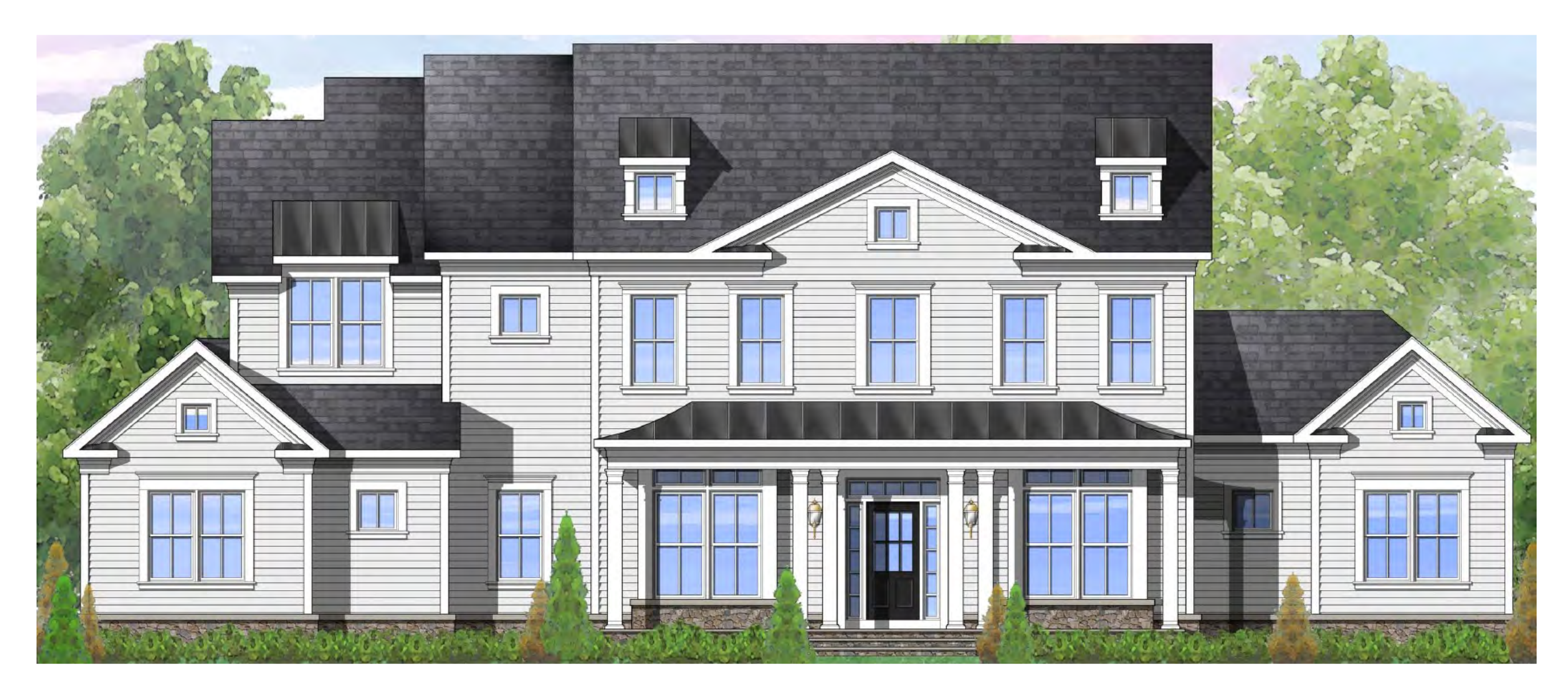
Elevation 3B shown with optional stone water table and dormer windows