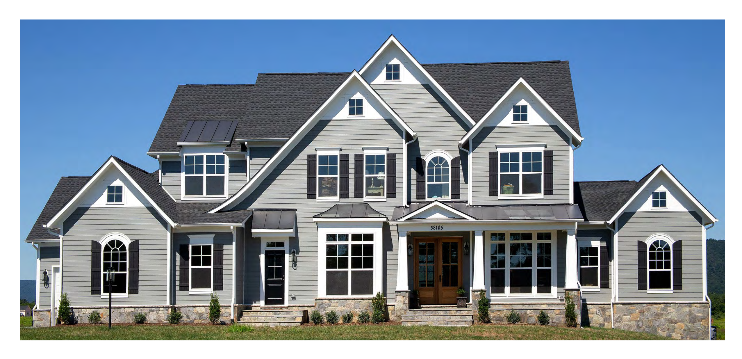
Elevation 4B shown with optional stone water table and double mahogany front doors