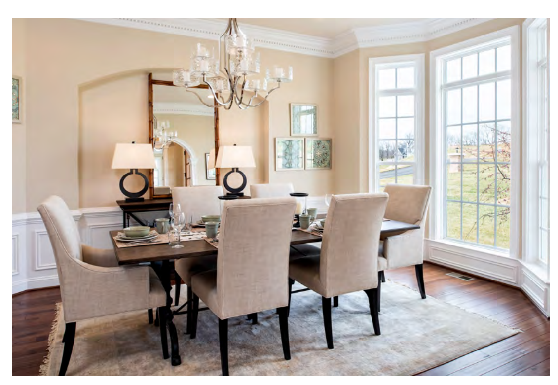
Dining room with decorative art niche, upgraded lighting, and floor-to-ceiling bay window