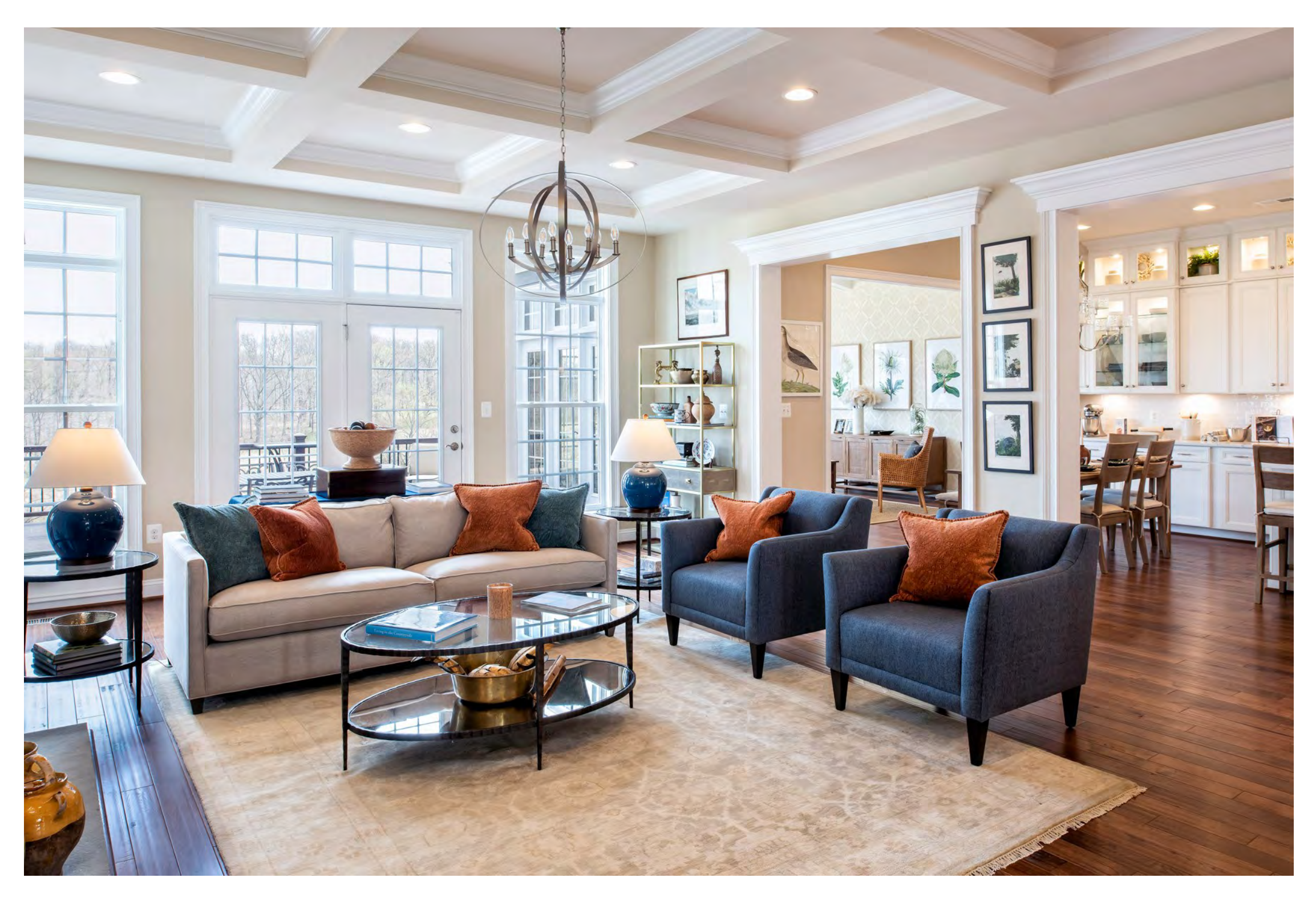
Family room with coffered ceiling looking into kitchen and keeping room