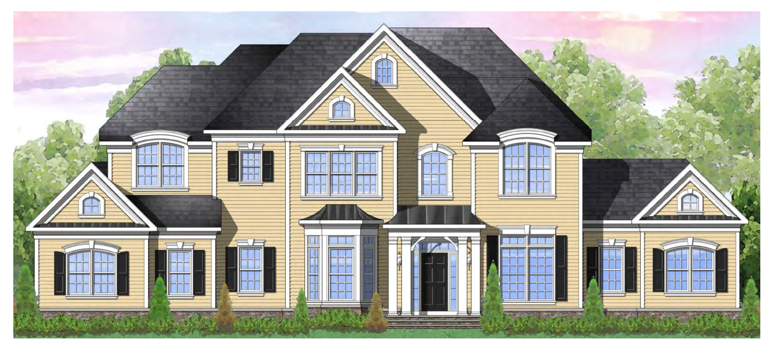
Elevation 6A shown with optional stone water table