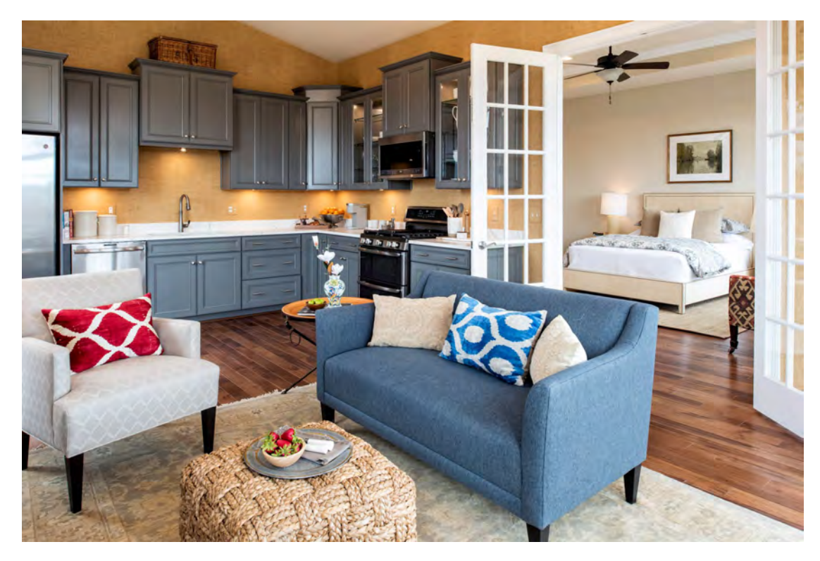
Optional deluxe multi-generational suite with kitchen, family room space, and double French doors leading to bedroom