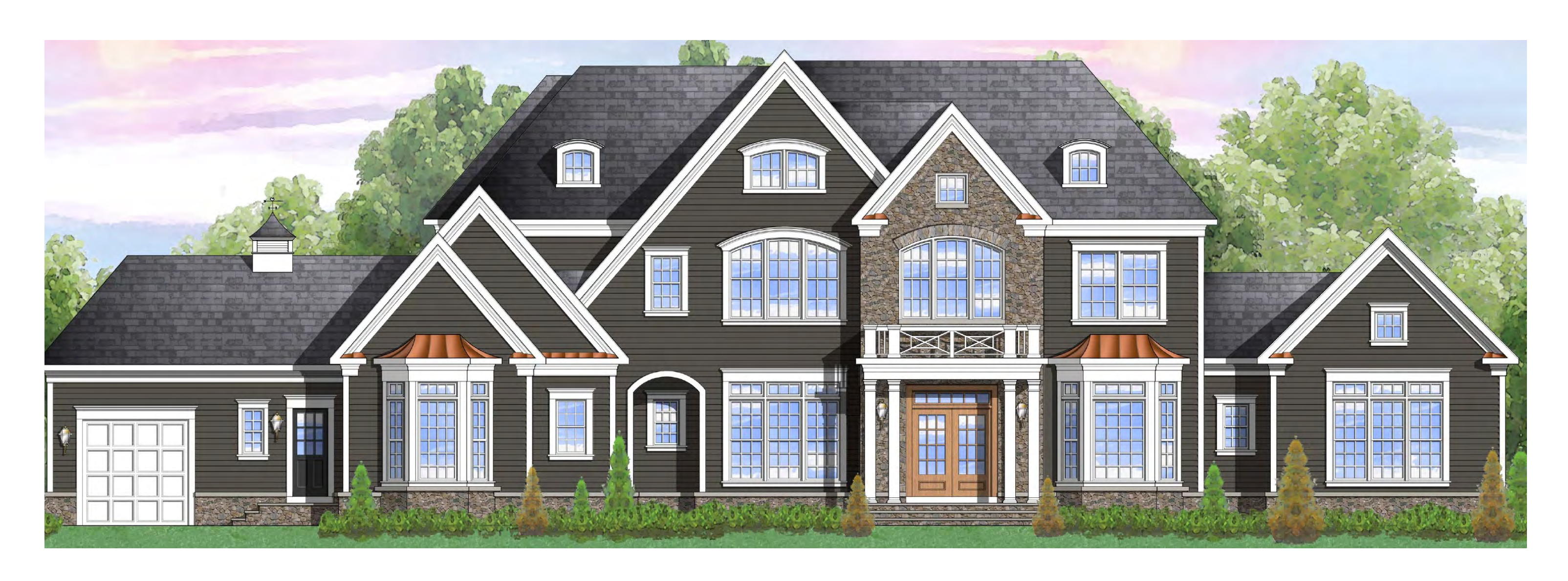
Elevation 3A shown with optional stone, side club room, and cupola with weathervane