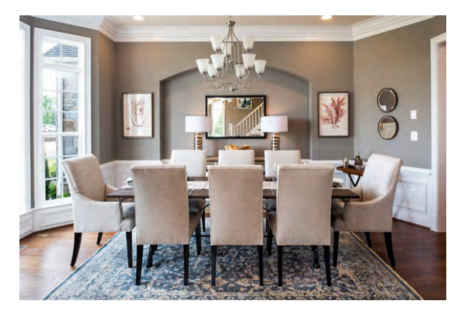
Dining room with bay window and art/furniture niche