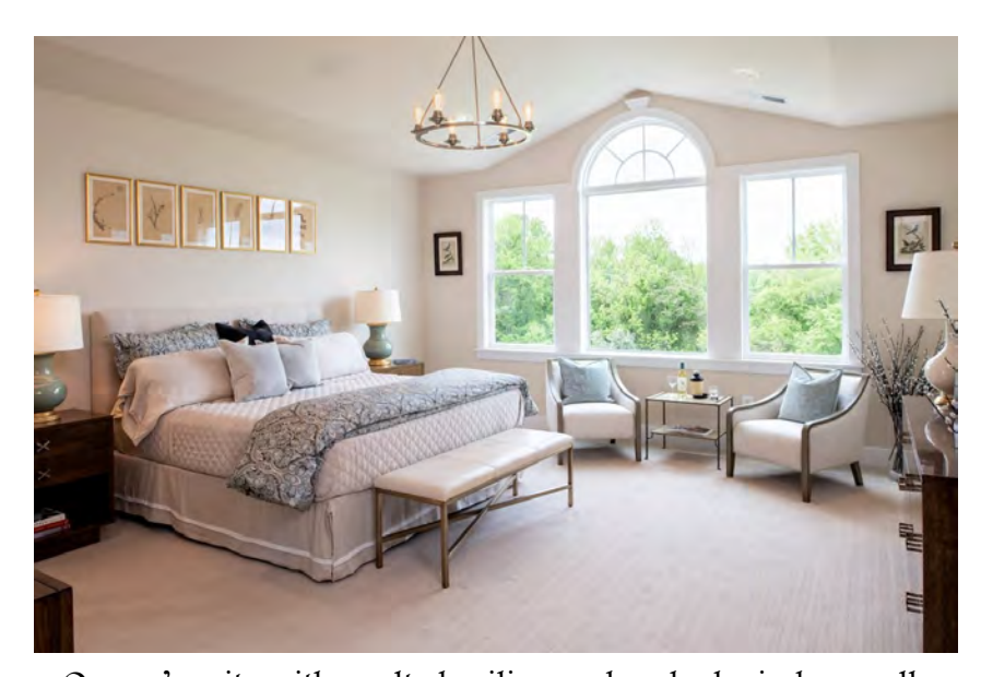
Owner's suite with vaulted ceiling and arched window wall