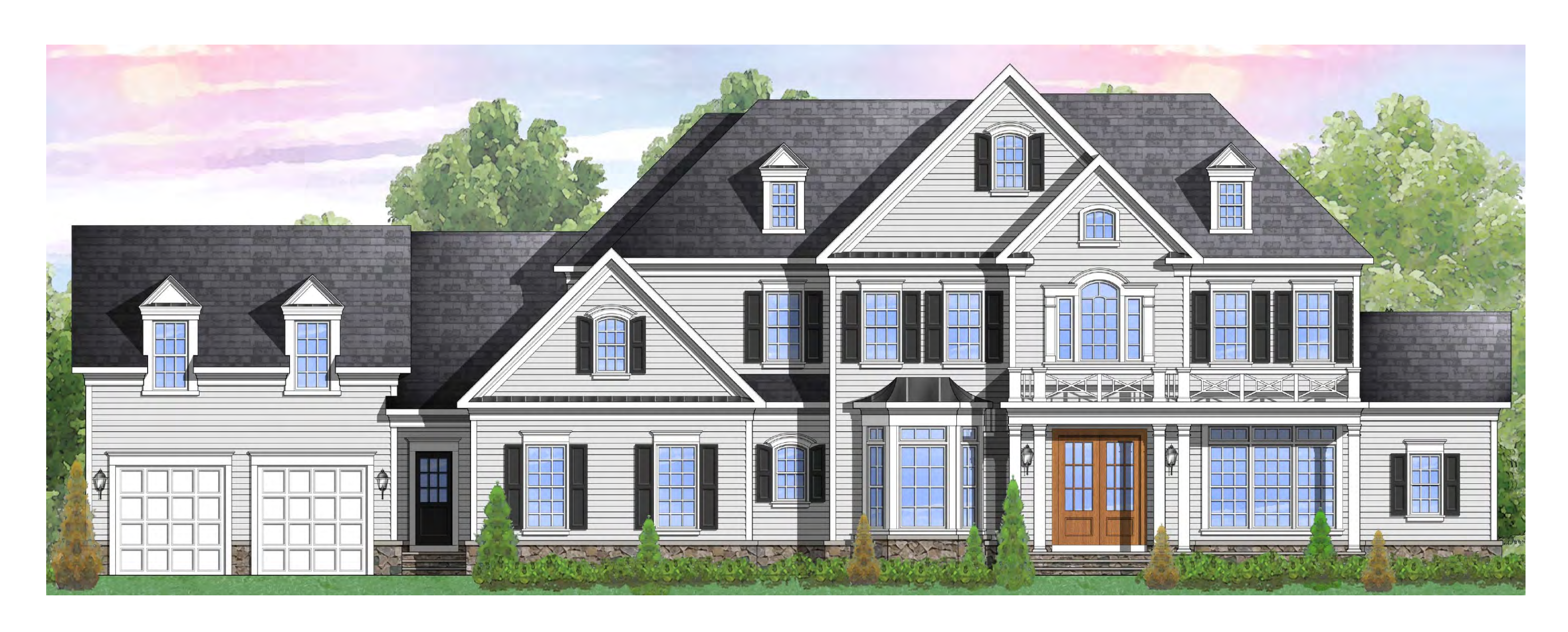
Elevation 4B shown with optional stone water table, rear club room, four car garage, and hobby room