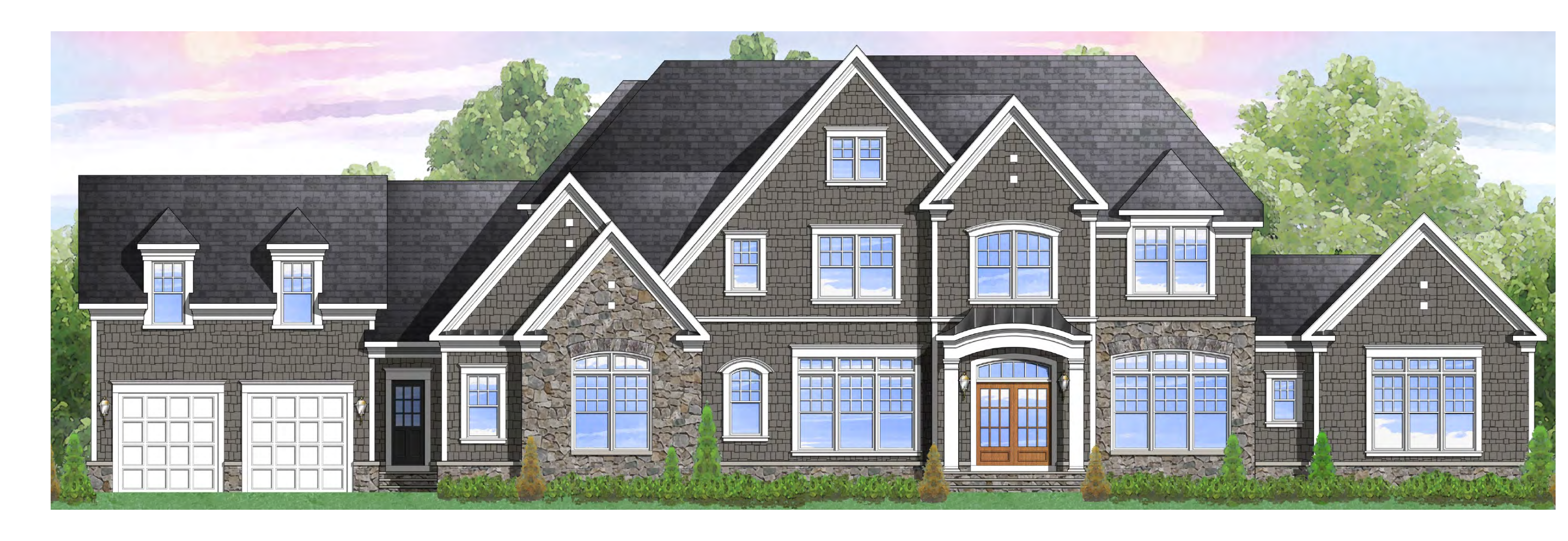
Elevation 5A shown with optional stone, shingles, side club room, four car garage, and hobby room