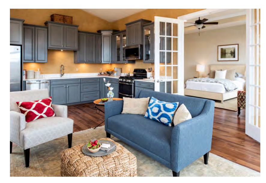
Optional multi-generational suite with kitchen, living space, bedroom, and full bath