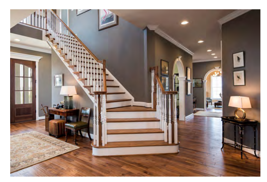
Dramatic foyer with reverse staircase