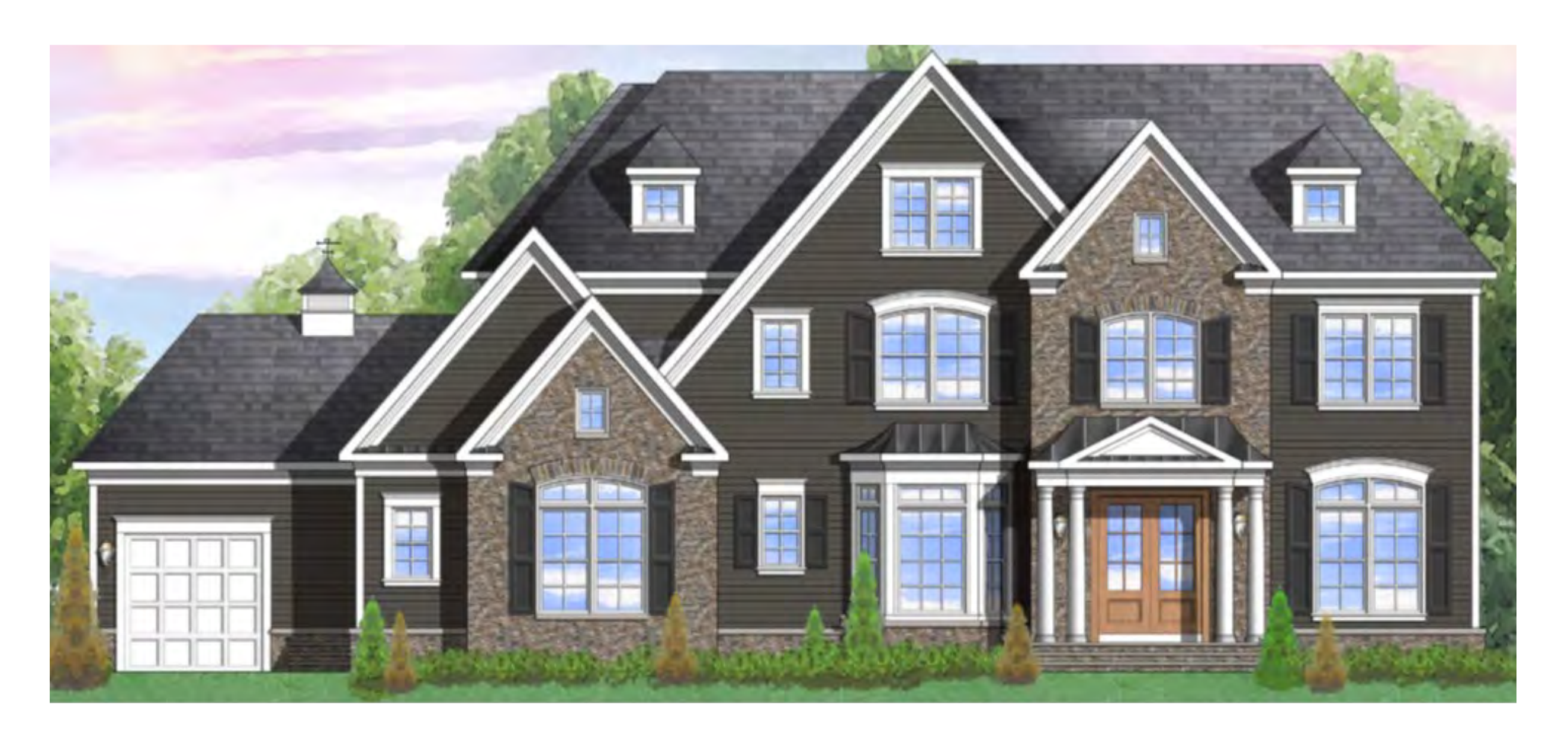
Elevation 2A shown with optional stone and cupola and weathervane