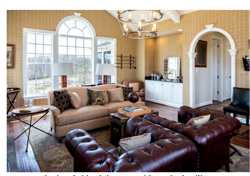
Optional side club room with vaulted ceiling